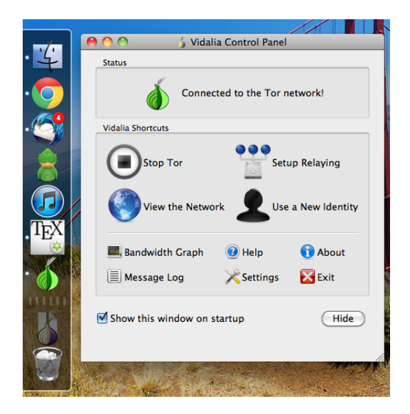
Figure 2: Vidalia reporting a connection to the Tor network, even though the Tor Browser window has been closed.

Finally, the Tor Browser Bundle could hiding the Vidalia control panel, since having two applications with two separate browser windows and two separate icons often confuses users. Finally, if user accidentally closes the Tor Browser, Vidalia continues to inform the user that they are connected to the Tor network, as pictured in figure 2. This caused several users who accidentally closed the Tor Browser to erronously believe that all browser traffic was being anonymized.