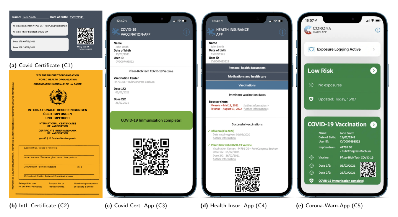
Fig. 1. Mock-ups of vaccination certificates, one of which was shown to each participant in the questionnaire.