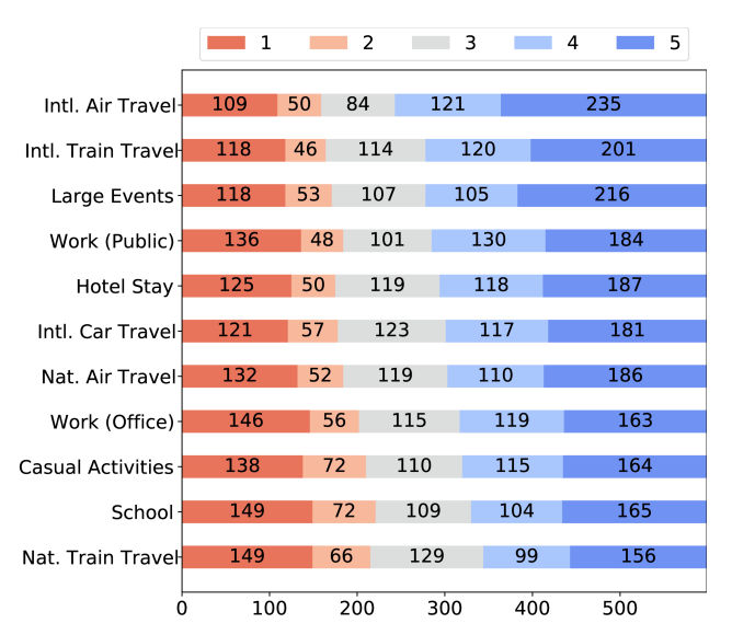
Fig. 3. Overview of participants' willingness to use vaccination certificates as a requirement for specific activities (Q28). Responses were collected on equidistant five-point scales.

travel activities. Participants indicated their willingness to use their vaccination certificate on five-point scales for each purpose. While we only observe minor differences among the five conditions for each purpose, we find tendencies indicating that participants are more willing to use their vaccination certificate for more extraordinary purposes. Across all conditions, 356 out of 599 participants provided positive responses for International Air Travel , compared to 255 positive responses for National Train Travel , which also includes local public transport. Similarly, using the certificate to attend Large Events such as sports events or concerts finds broader acceptance than more Casual Activities such as going to a restaurant. The distribution of responses to all purposes we considered is illustrated in Figure 3.